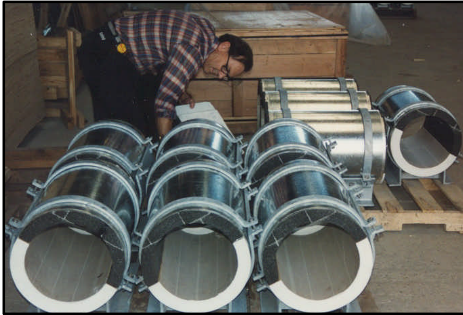
Combination PUF and Foamglas Support